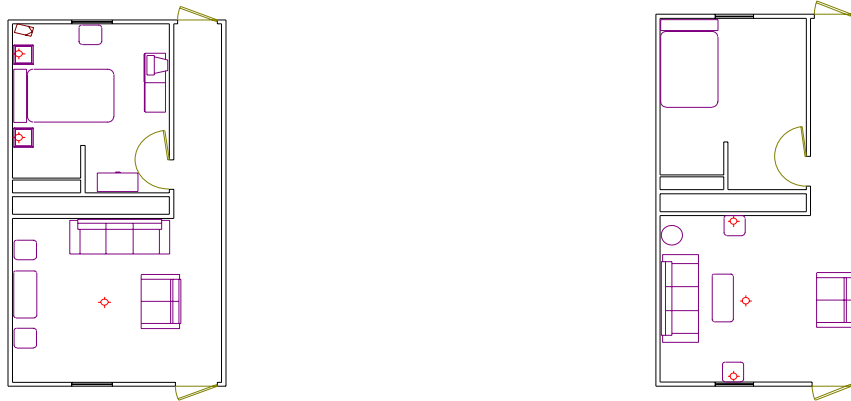
Figure 3 Furniture Layout for Experiment Set A & C Figure 4 furniture layout for Experiment Set B & D

All experiment sets were ignited by the application of a propane torch to a small plastic bag containing a 4"x4" piece of cotton fabric rag doused with about 4 ml gasoline. Experiment sets "A" and "C" were ignited near the head of the bed on the polyurethane bedspread. Experiment set "B" and "D" were ignited near the center of the couch at the base of the vertical cushion.