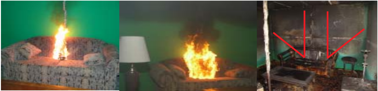
Experiment Set B: Experiment 4