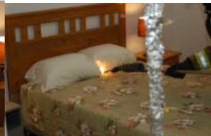
Experiment Set C: Experiment 6