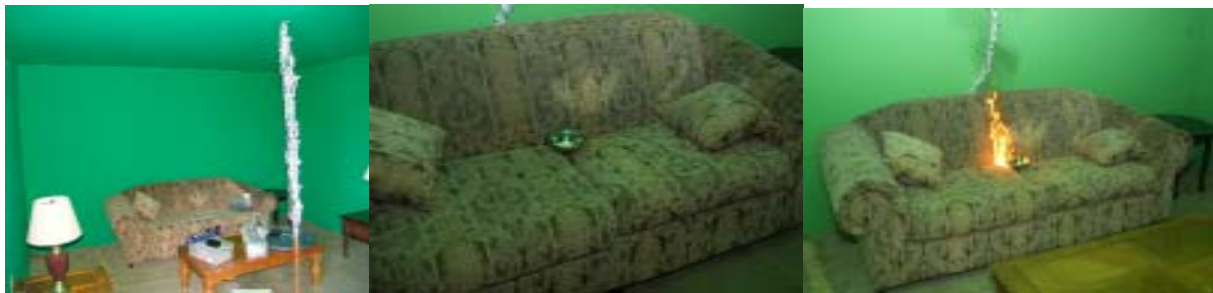
Experiment Set B: Experiment 4