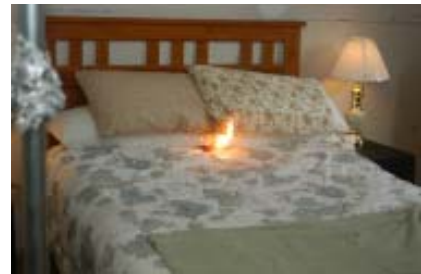
Experiment Set C: Experiment 5