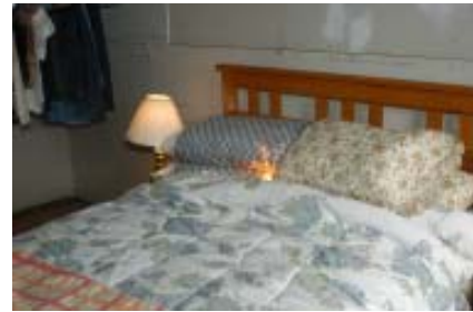
Experiment Set A: Experiment 2