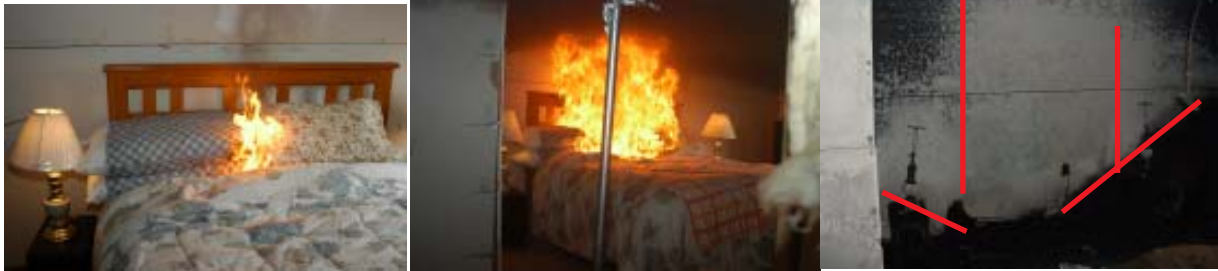
Experiment Set A: Experiment 2